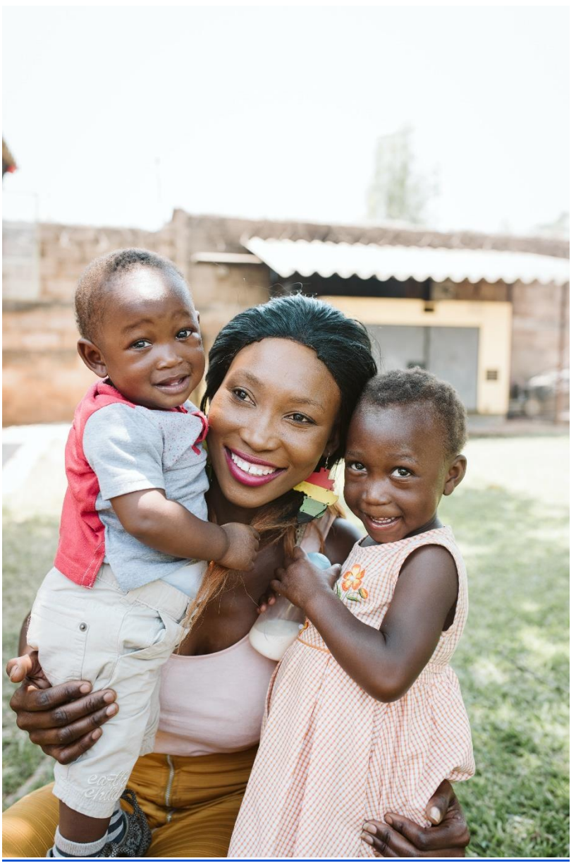
Photography of reunified families through direct programming